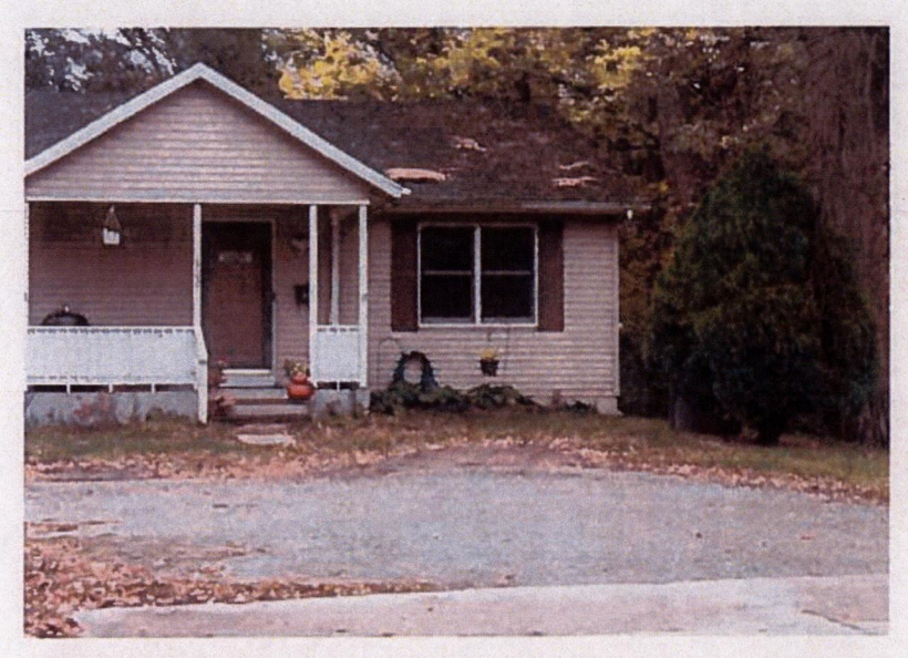
302 S. Indiana Ave.