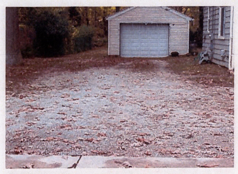
605 S. Indiana Ave.